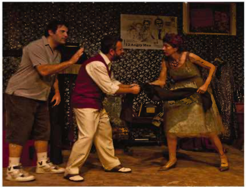
Over the Moon rehearsal